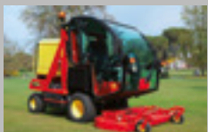
TURBO 1-1W-2-4 28-44 hp