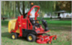
GT 28 hp