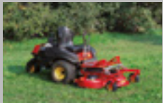
TURBO Z 22-23 hp