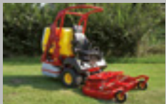
TURBOGRASS 22-23 hp