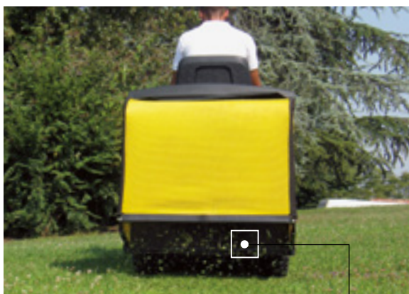
Cut-and-drop rear discharge

The counter-rotating blades provide a strong aerodynamic thrust, forcing the cut grass directly into the collector. The collection chute is shaped to follow the parabolic trajectory that the grass is naturally given after cutting, providing optimum flow without energy loss, and better compaction of the grass in the collector, as a result. The direct collect system of the grass avoids clogging even in tough conditions with tall, moist grass. The special design of the chute helps fill the collector to the optimum level and, together the outstanding grass compaction, it means an even greater capacity. The collection chute is fitted with a hatch for easy inspection and cleaning.