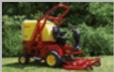
PG - SR 22-28 hp