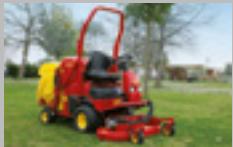
GTS 22-23 hp