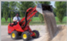
TURBOLOADER 22-44 hp