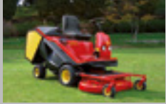
GTR 16-20 hp