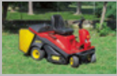
GTM - GSM 15,5-16 hp