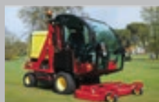
TURBO 1-1W-2-4 28-44 hp