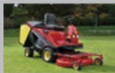
GTR 16-20 hp