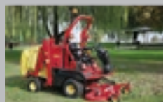
GT 28 hp