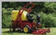
PG - SR 22-28 hp