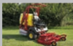
TURBOGRASS 22-23 hp