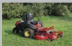
TURBO Z 23 hp