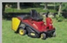
GTM - GSM 15,5-16 hp