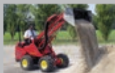
TURBOLOADER 22-36 hp