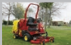
GTS 22-23 hp